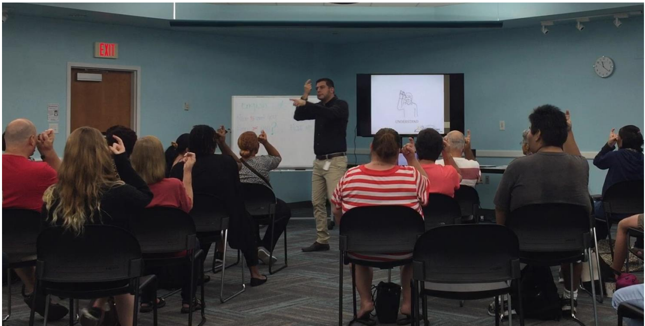
BELOW: American Sign Language for Beginners at Hart Memorial Library.