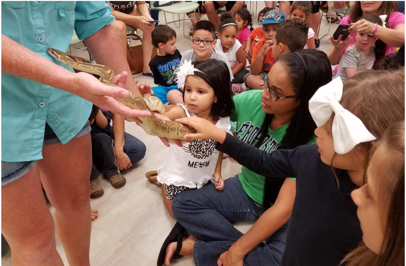
BELOW: Summer Reading, Amazing Animals presenting at the Buenaventura Lakes Library.