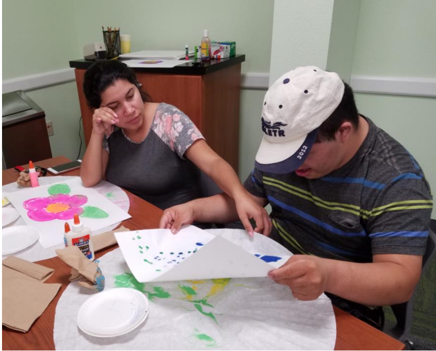
LEFT: Sand Painting at Hart Memorial Library as an inclusive program.