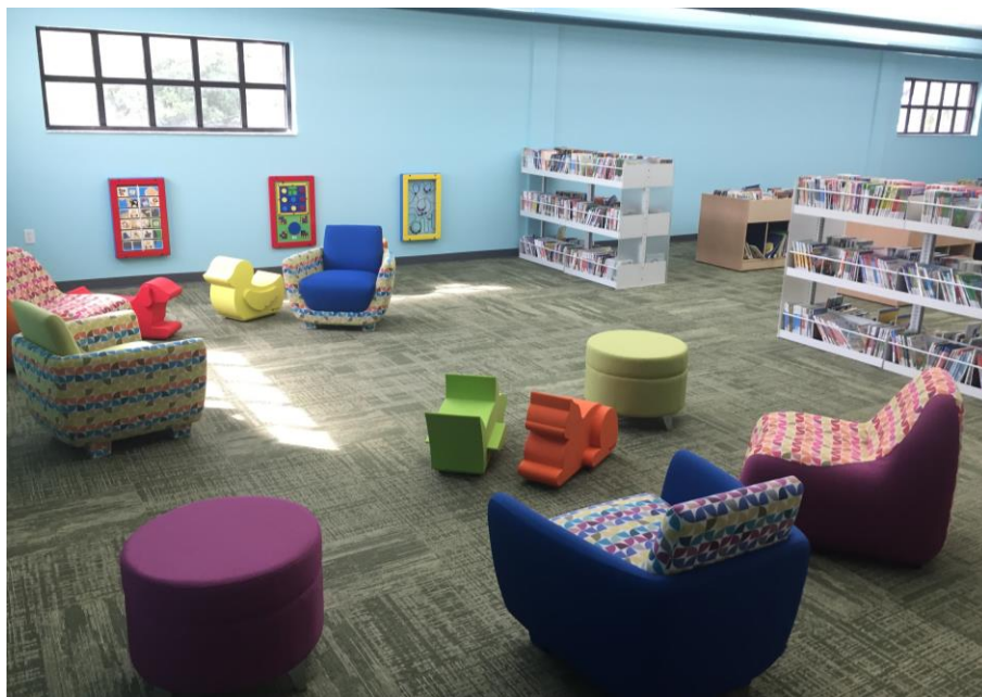
ABOVE: St. Cloud Library first floor after renovations.