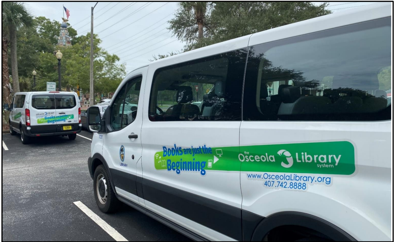
Above: The Library added new eye-catching decals to its courier vans to encourage greater community visibility of Library services. The courier vans travel about 70 miles across Osceola County each day.