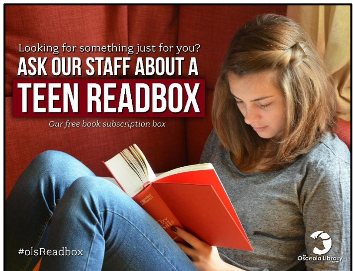
Left and Above: Inserts for the Teen READBOX feature craft instructions and recommended reads. Promotional materials are on display in each library.