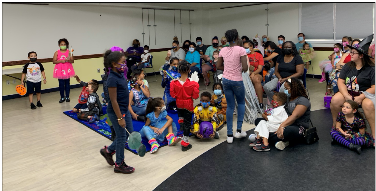
Above: Families gather for a storytime at the Poinciana Library's Spooky Spooktacular that drew an exciting crowd of over 300 people.