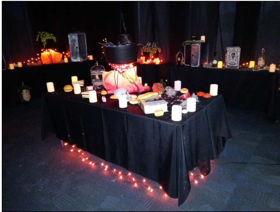
Left: St. Cloud Library's meeting room is transformed into a haunted kitchen for Hansel & Gretel: Escape the GRIMM Kitchen escape room program for adults.