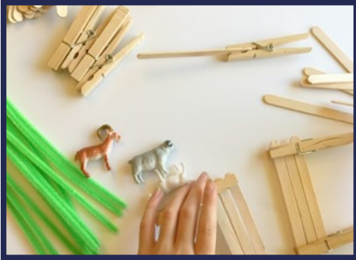
Figure out how to build a bridge that would support all three goats at once.

Get your mind thinking and make the Three Billy Goats Gruff story come to life!