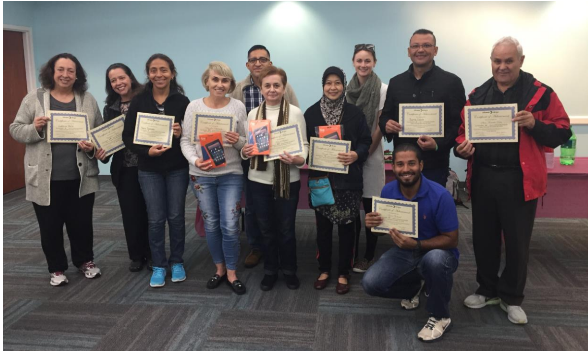
ABOVE: Everyday English Graduates at Hart Memorial Library - made possible by American Dream Literacy Grant.