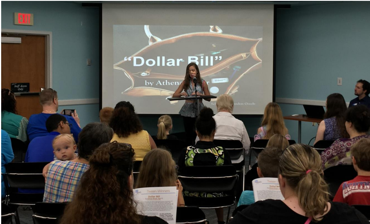
BELOW: One of the Lit Mag 2018 winners reads her work aloud at the Reception at Hart Memorial Library.