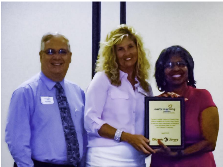
LEFT: Osceola Library receiving the ELC Award