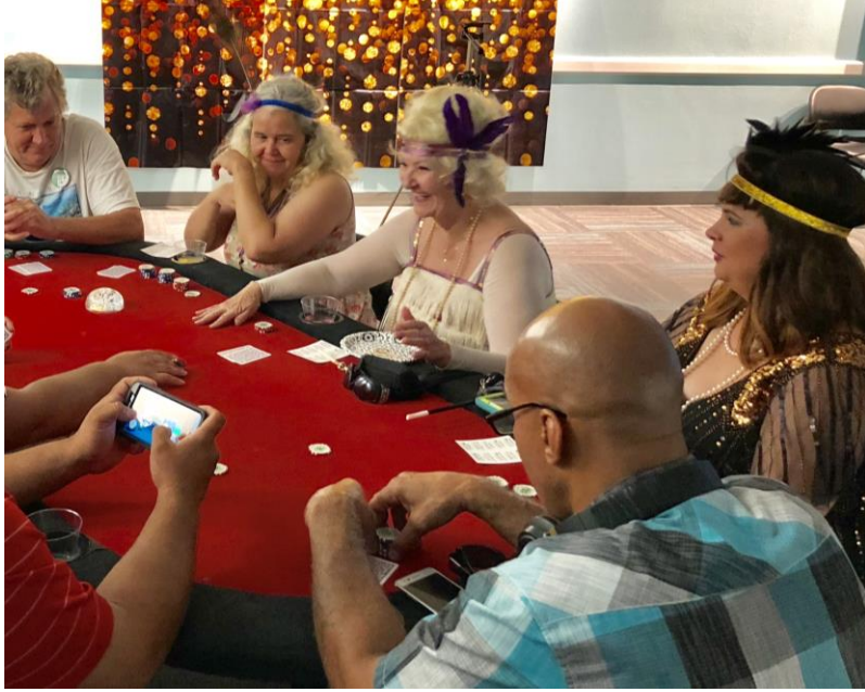
LEFT: Great Gatsby Poker Night at Hart Memorial Library.