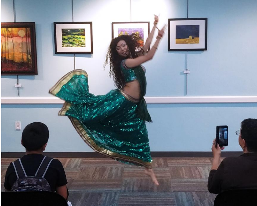
LEFT: International Festival at Hart Memorial Library.