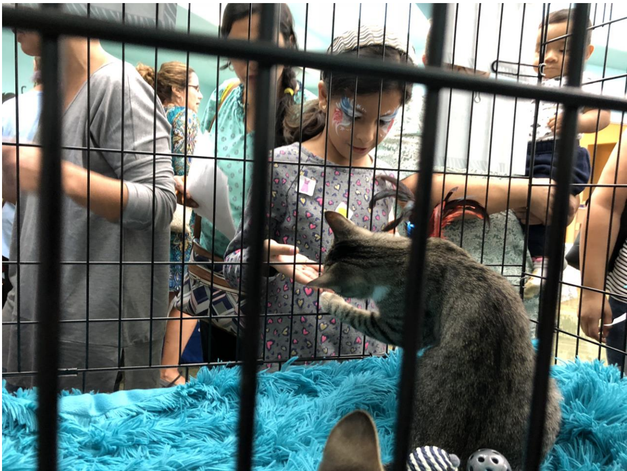
BELOW: Caturday Cat Faire at Hart Memorial Library.