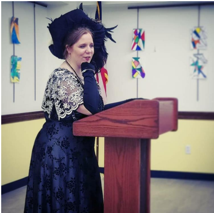
ABOVE - LEFT: Bridal Expo at the St. Cloud Library.