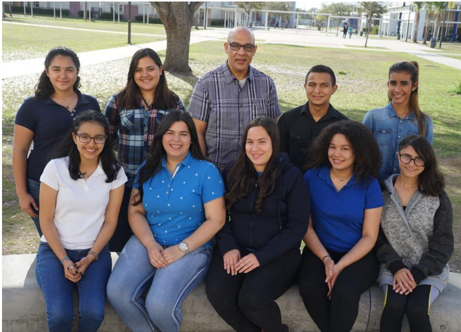
ABOVE: Osceola Staff in Puerto Rico visiting our adopted library, made possible by the American Dream Literacy Grant.