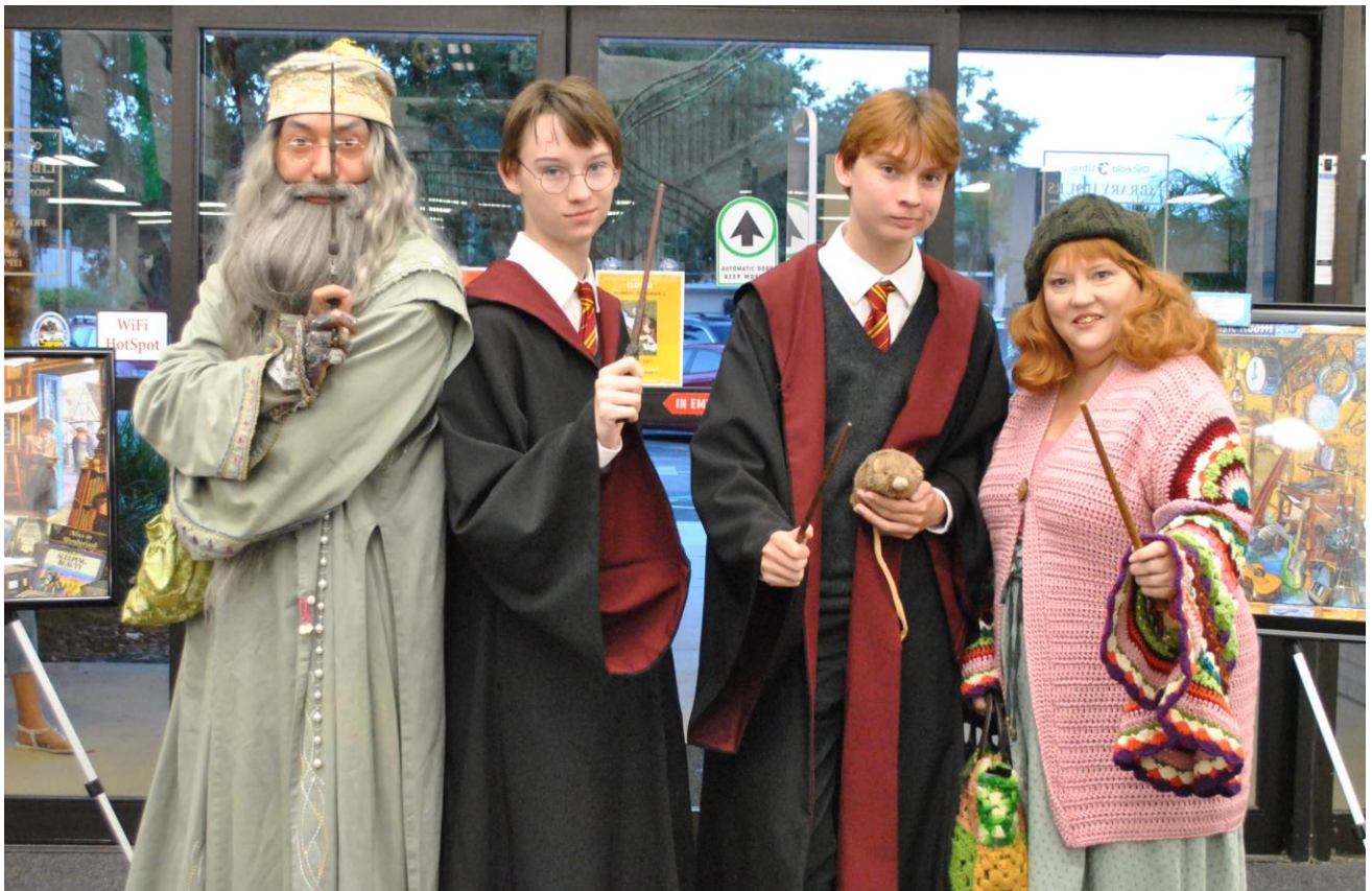
BELOW: Sorcerers at Sunset after-hours event at the St. Cloud Library as part of a month of Harry Potter.