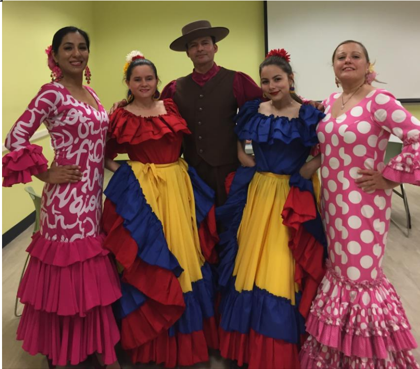
LEFT: Arte Bajo La Sombrilla event at the Buenaventura Lakes Library, celebrating artists from different countries including Spain and Venezuela.