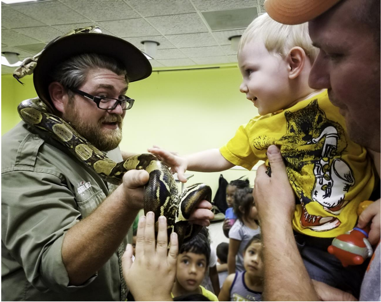
ABOVE: Gatorland at the Buenaventura Lakes Library as part of our Summer Reading programs.