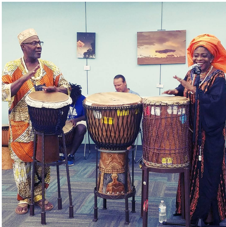
LEFT: Orisirisi African Folklore performance for Black History Month at Hart Memorial Library.