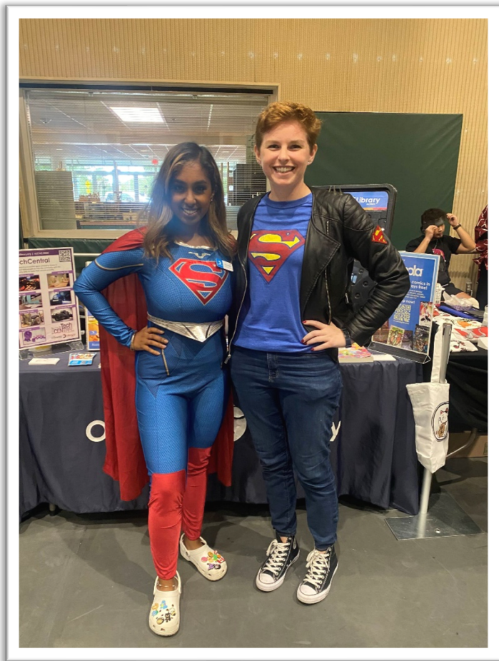
Left and Below: Library staff were on hand at Fandom Kissimmee to rescue any non-library card holders from their book-less fate or teach them how to create their own comic book!