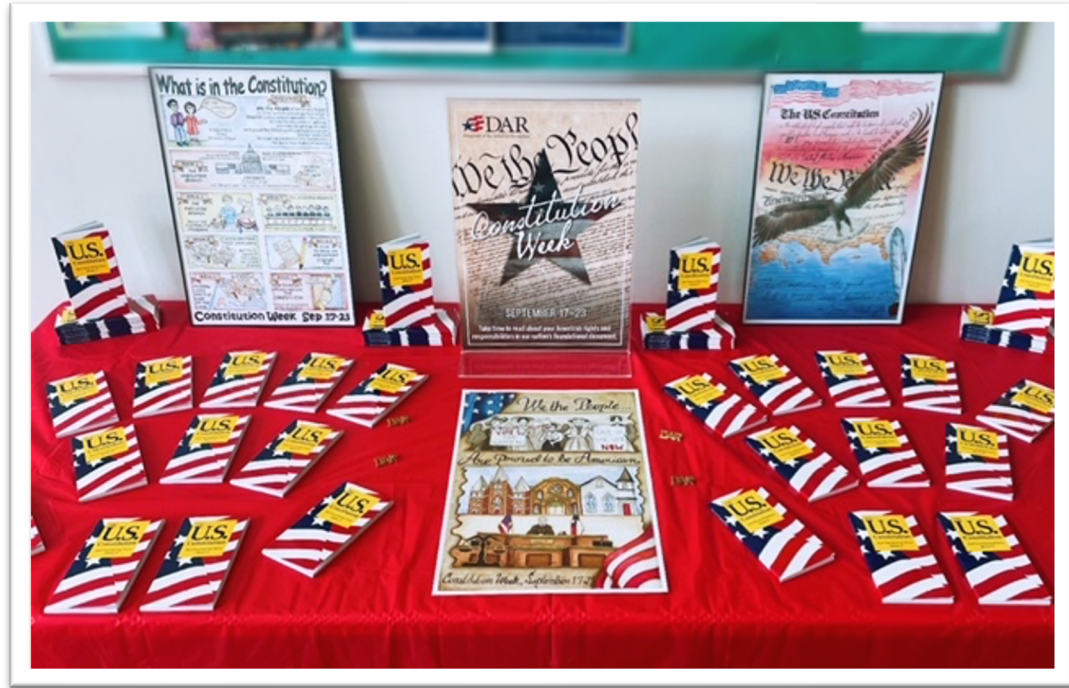
Left: The Osceola Friends of the Library provided 250 pocket Constitutions for patrons to take home in celebration of Constitution Week.