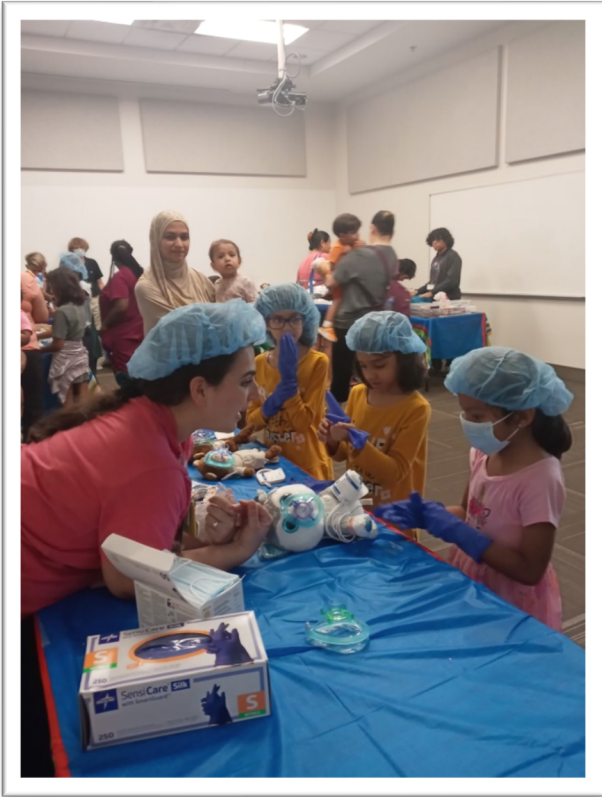
Left and Below: Nemours Children’s Health opened their Teddy Bear Clinic to help children alleviate fears about doctor visits.