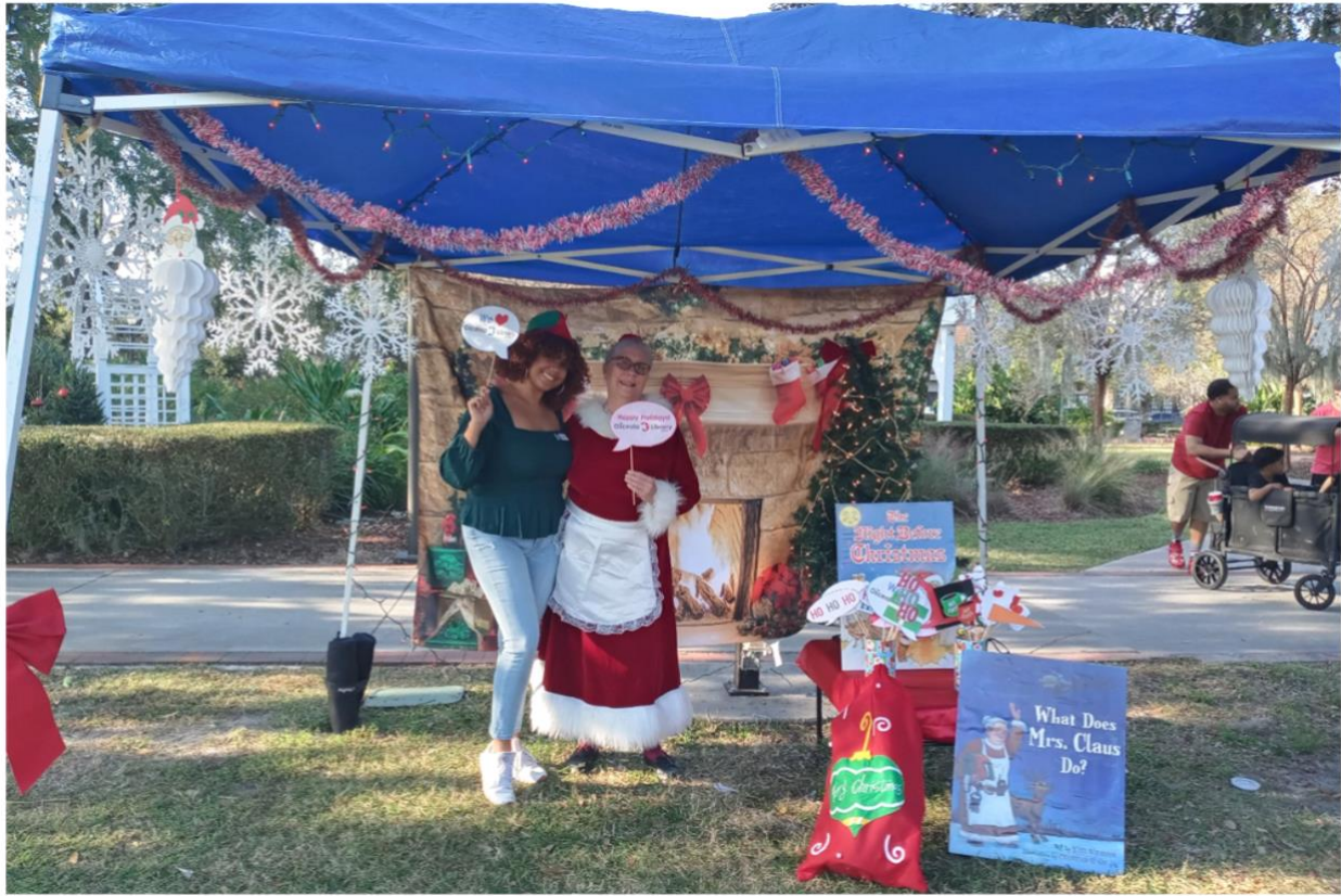
Above: Mrs. Claus greeted all the good children and adults of Osceola County at the Kissimmee Festival of Lights Pop-Up Photo Shop.