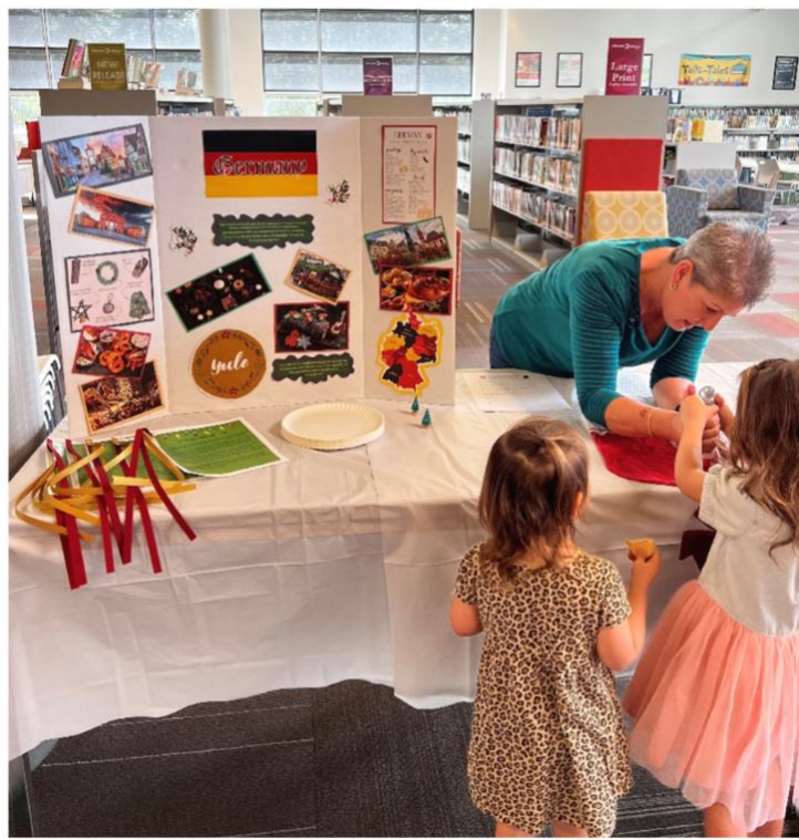
Left: Holiday traditions from countries around the world were on display at the West Osceola (pictured) and Poinciana Libraries.