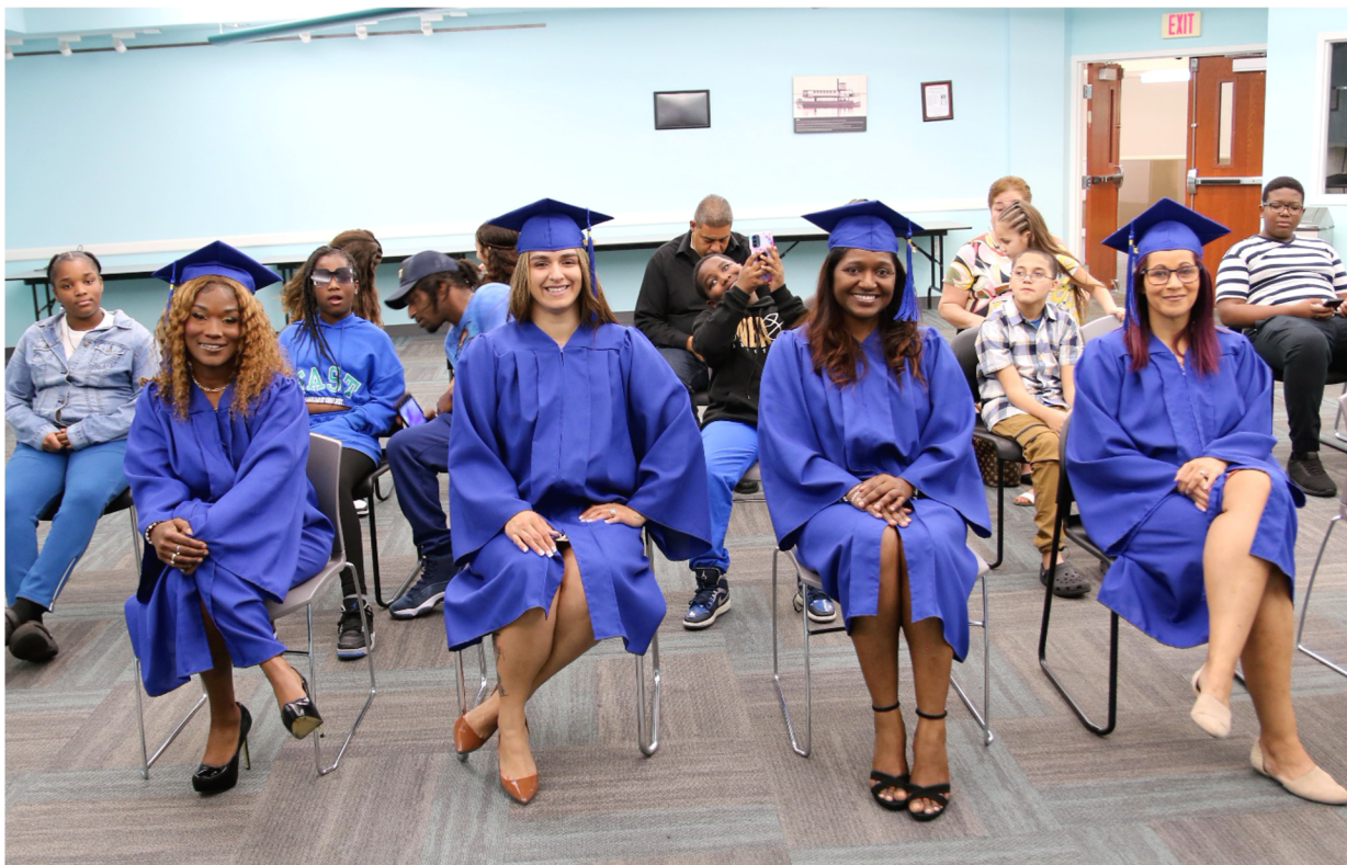
Above: Proud COHS students prepare to graduate. Below & Right: Young artists learn about Faith Ringgold, interpret her story quilt in this Black History month program.