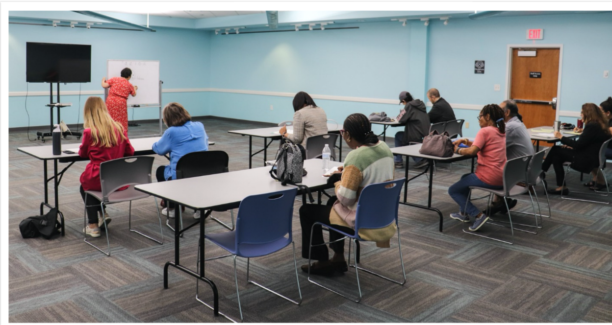
Below: Students listen attentively as the Spanish for Beginners' instructor prepares a lesson.