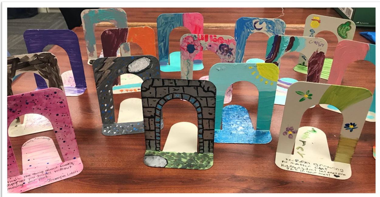
Above: Patrons decorated bookends in recognition of National Library Week.

Library Workers Appreciation Day: Goodies, decorations and a fun library-themed pin were part of the day's celebration for the incredible Library staff.