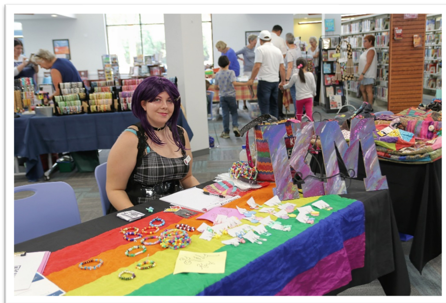
Above and Left: Upstairs at the Hart Memorial Library was a celebration of Free Comic Book Day with games, crafts, costume contest and a make your own comic workshop. Downstairs, crafters of all kinds presented their original creations just in time for Mother's