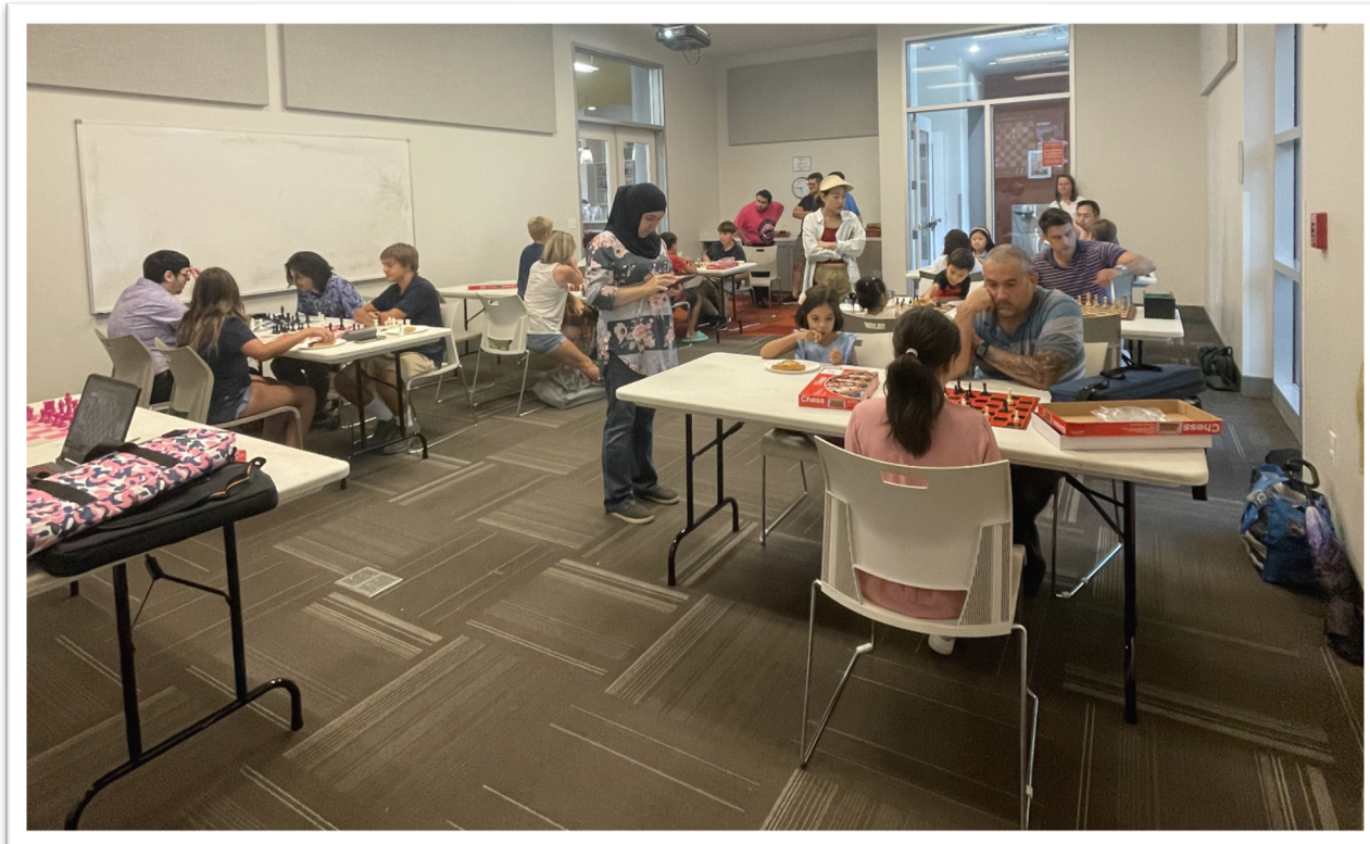
Above: The Chess Club at the West Osceola Library is the place to be afterschool where you can strategize, compete and learn while having a fun. Below: Kid crafters showcased their creative talents and business acumen at the St. Cloud Library's Kids Crafter's Fair. Both programs are excellent community-specific events for all the whole family to enjoy.