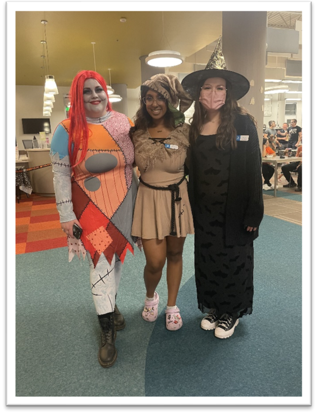
Above and left: Kids and staff alike loved dressing up for the Spooky Spectacular parties that brought almost 800 people to the libraries.