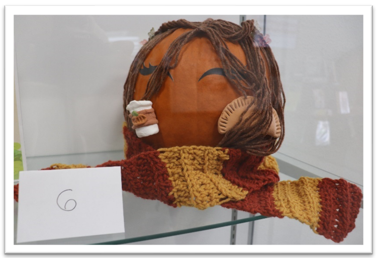
Above and left: Patrons entered their imaginative creations in the Literary Pumpkin Decorating contest at the Hart Memorial and West Osceola Libraries.